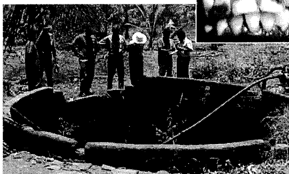
Dental danger. Geochemists studying the quality of water in a well in the dry zone of Sri Lanka. (Inset) Teeth from a patient with dental fluorosis in Sri Lanka.

From a strictly scientific perspective, one of the most interesting aspects of these studies is the biomineralogy of tooth enamel and the process by which hydroxyapatite, the